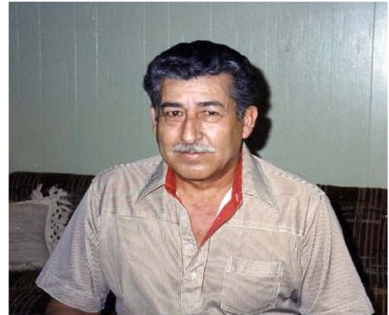
Table Shuffleboard Association Hall of Fame Inductee