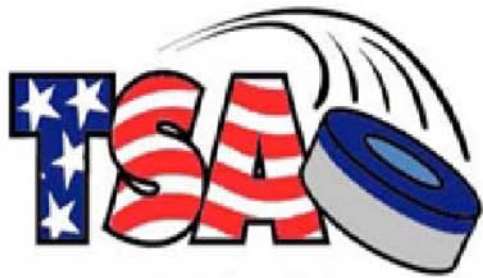
Table Shuffleboard Association, Inc.