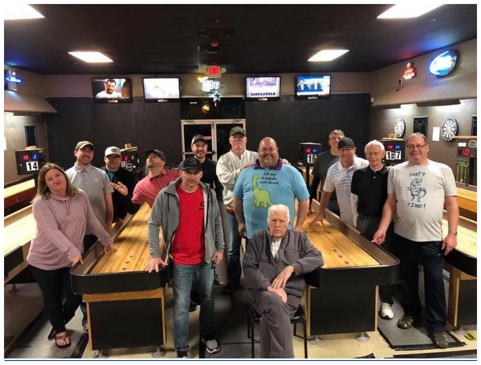
History in the making!