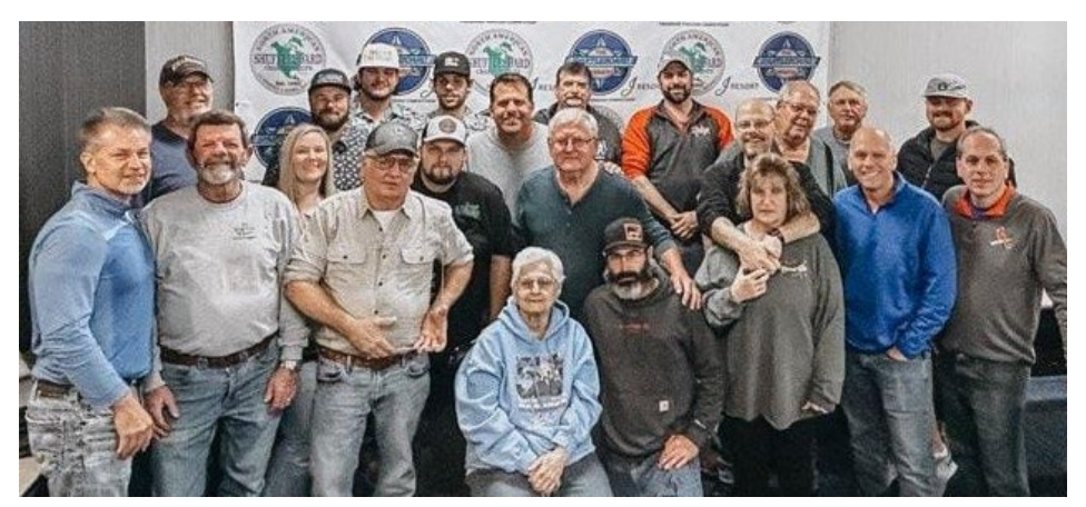
Missouri Players 2023 NASC