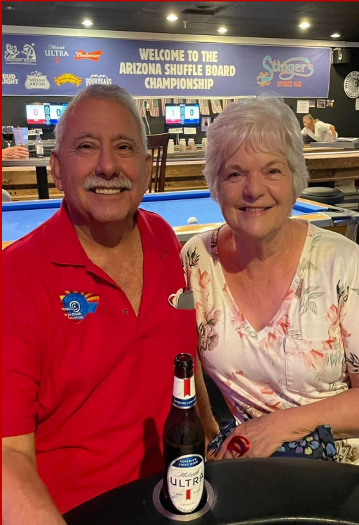
Table Shuffleboard Association Hall of Fame Induction January 7 th , 2023 Stingers Sports Bar Glendale, AZ