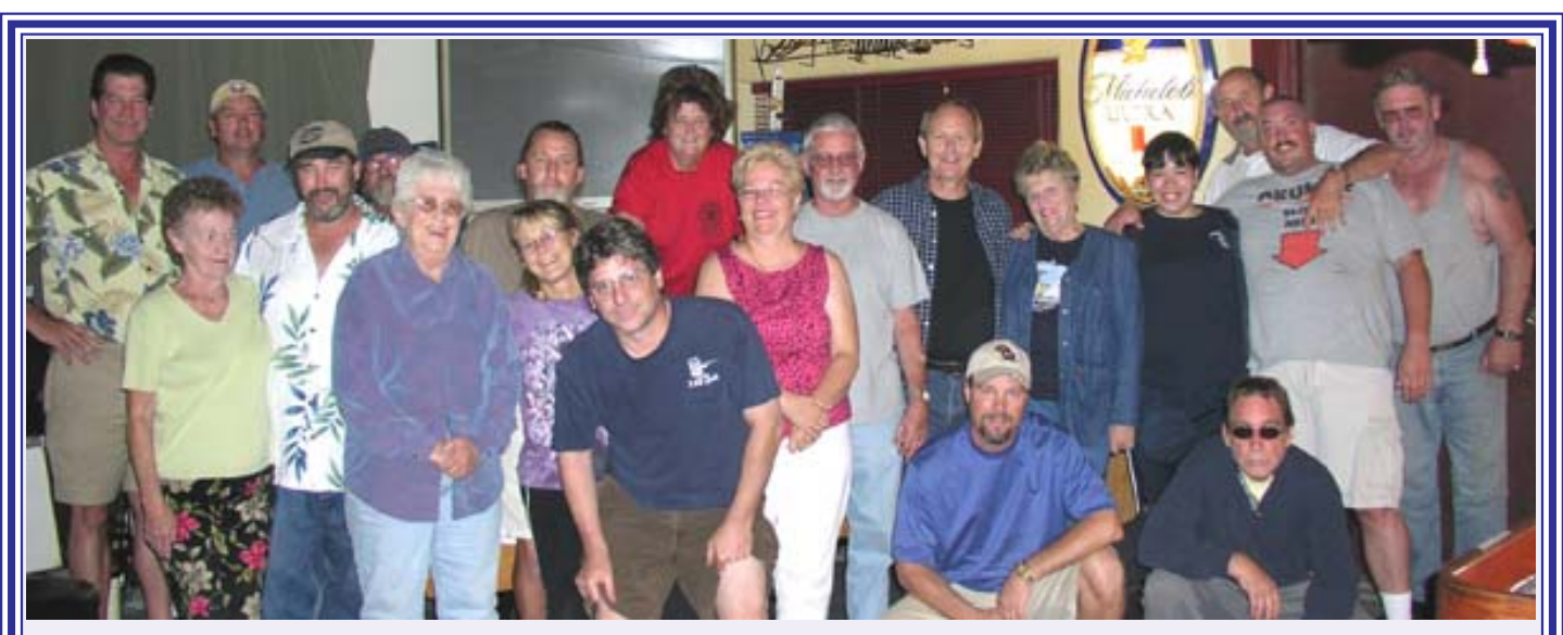
Above: Group Photo are the die-hards still there at 3am for the Open Doubles Below: Miscellaneous Photo Collage

Visit: http://www.tableshuffleboard.org/September_2005_TSAHOF_DougBuhlCeremony.htm