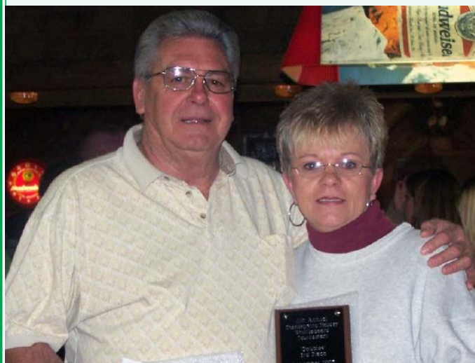
Above: (L-R) 3rd Place: