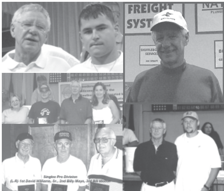
Table Shuffleboard Association