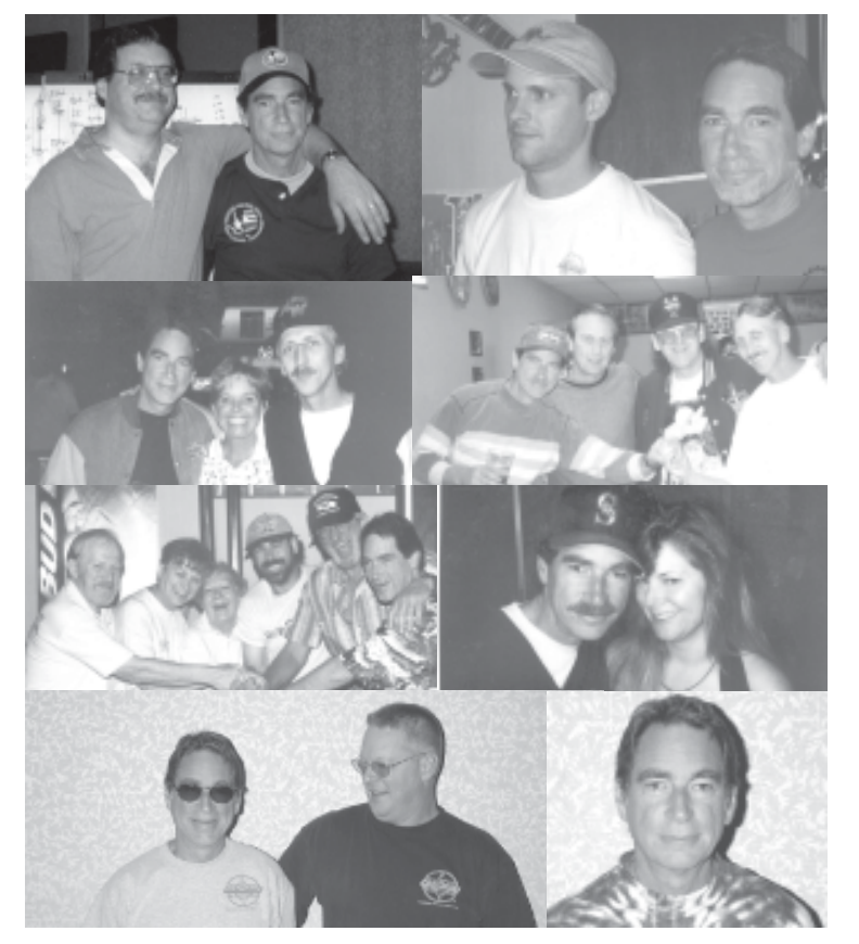
Table Shuffleboard Association