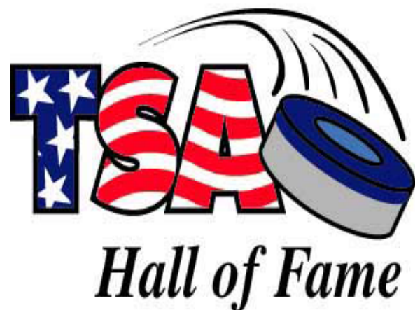
Table Shuffleboard Association, Inc.