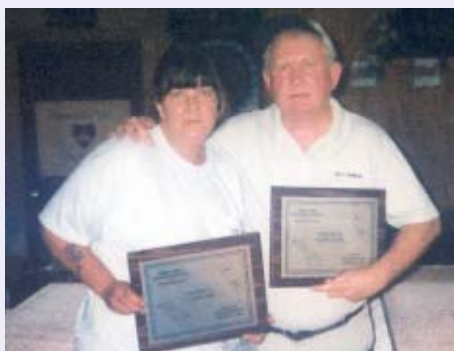
2nd Place: (L-R Above)