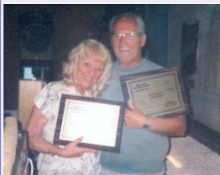
1st Place (L-R Above)