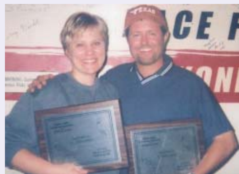
3rd Place: (L-R Above)