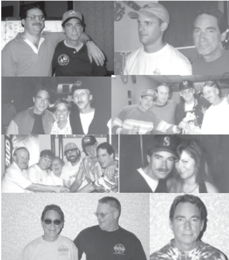
Table Shuffleboard Association